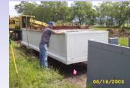
Placement of Raceway Units

Reymann Memorial Farms is a West Virginia University owned research facility located in Wardsville, West Virginia. Unlike the Dogwood Lakes facility, the terrain here is gentle and mostly flat. An abundant spring water source is available, with a total flow rate of 400 gallons per minute. The terrain, water collection, and waste disposal were among the significant challenges in installing the raceway system at this location.