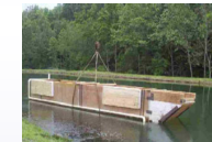
Launch of Raceway using 1-ton Crane