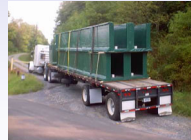
Transportation of Raceway Units

Dogwood Lakes is an acid mine water treatment facility located eight miles southwest of Morgantown, WV. The terrain at Dogwood Lakes is very rugged, making it nearly impossible to use conventional cast-in-place concrete raceways. Moreover, the owners of the facility will not allow permanent structures to be built at this site. It was decided that a series of four staggered raceway units would be used, with the quiescent zone of the preceding unit resting on the top of the following raceway. Water is first collected in a distribution box, which is used to equally divert the flow into the two parallel channels of the first raceway. After water flows through the first raceway, it cascades from tank to tank in a step-wise manner. After flowing through the final raceway, the water is discharged back into the same stream from which it was diverted.