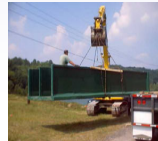
Unloading HFRP Raceway Units