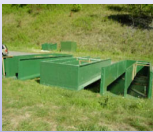
Completed Raceway Units