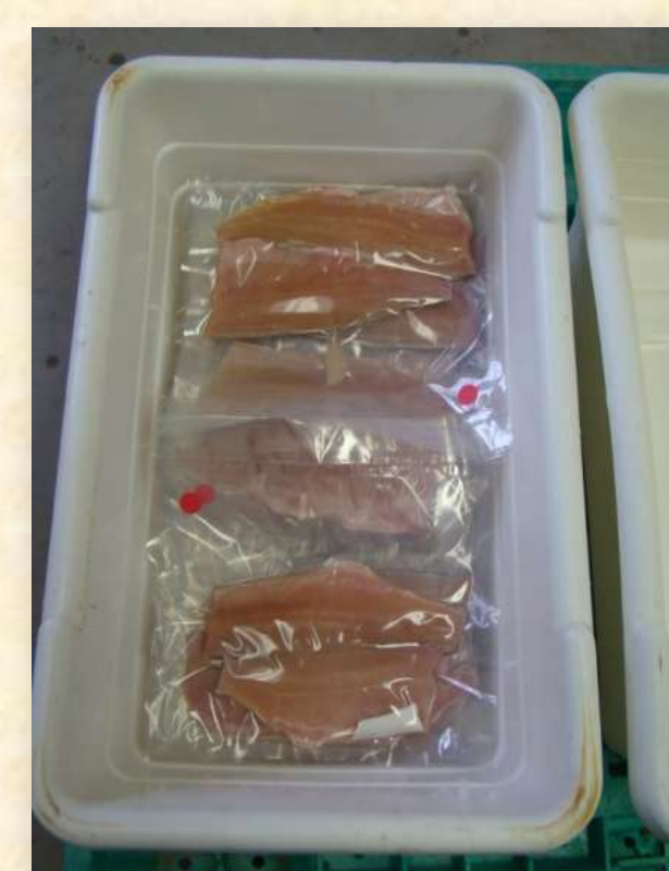
Vacuum packed brook trout (marked as "red" fish)