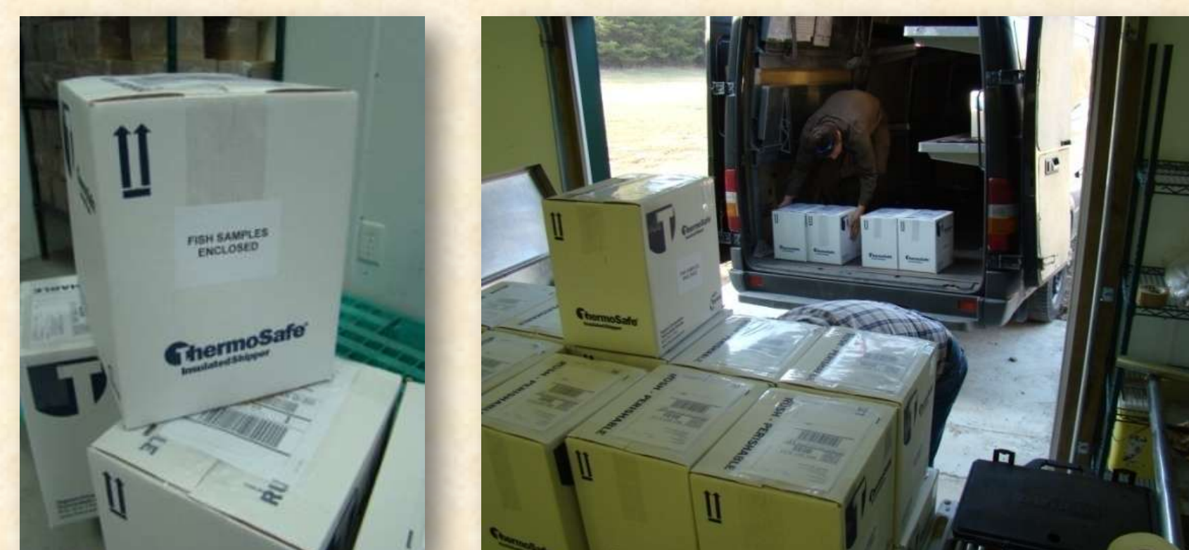
Shipping fish via UPS