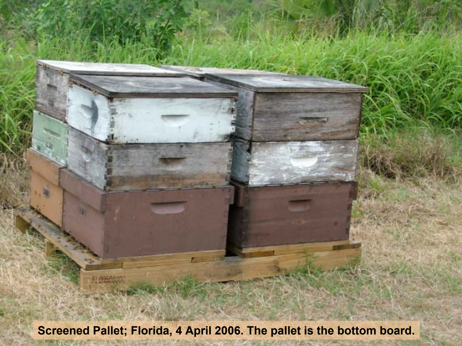
Screened Pallet; Florida, 4 April 2006. The pallet is the bottom board.