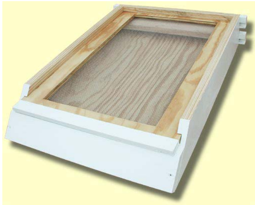
The ultimate screened bottom board with two removable trays.