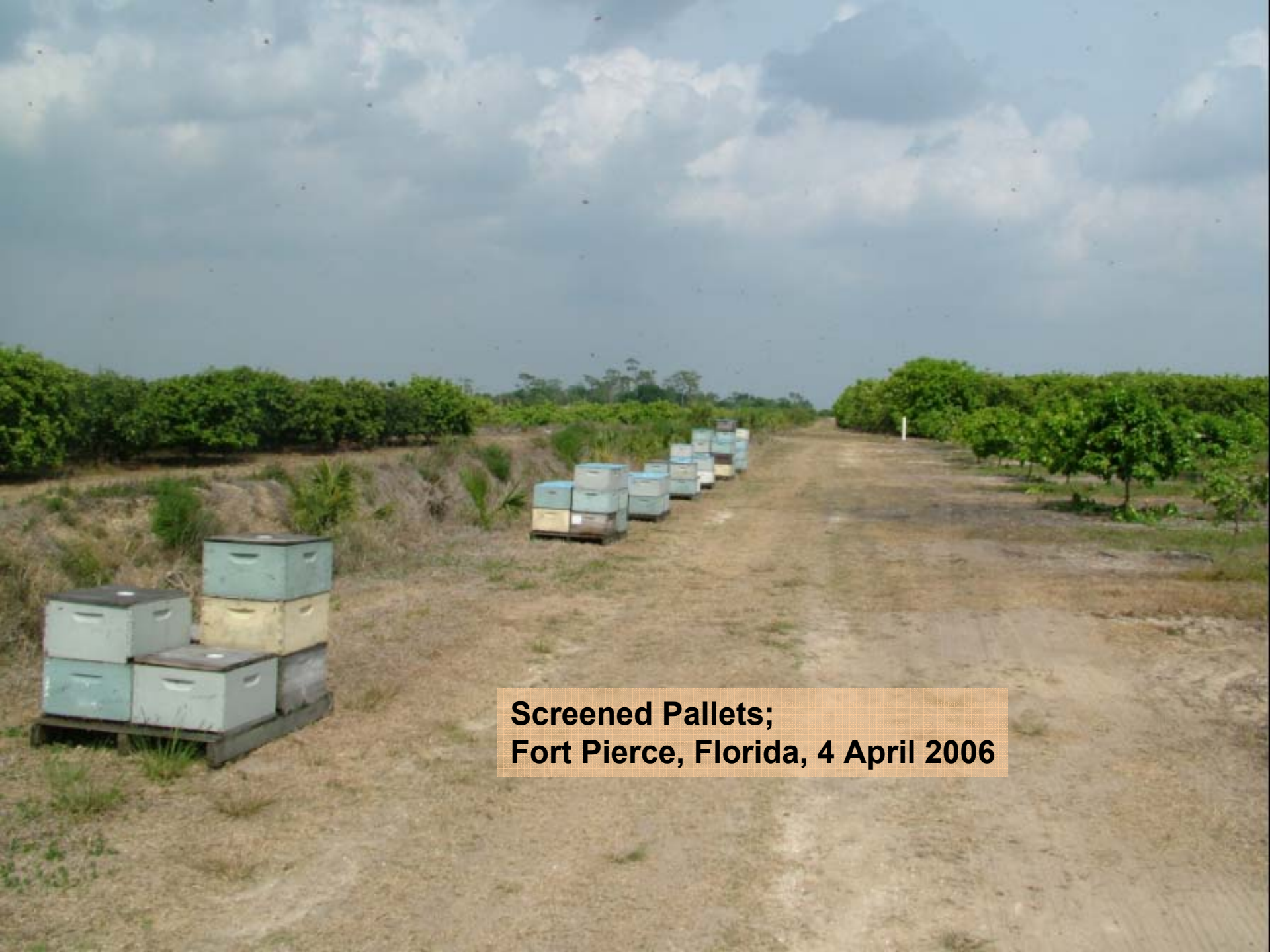
Screened Pallets; Fort Pierce, Florida, 4 April 2006