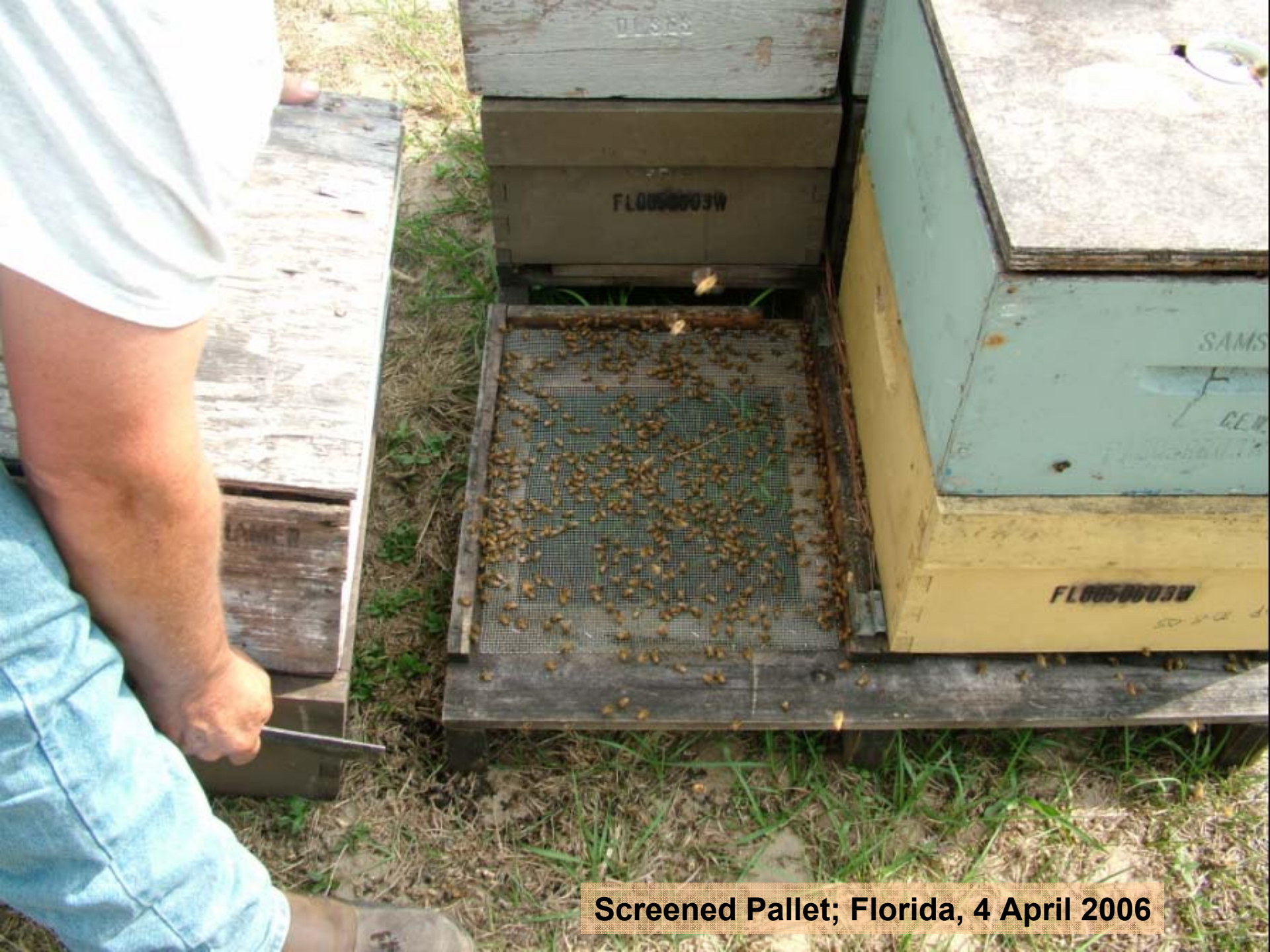
Screened Pallet; Florida, 4 April 2006