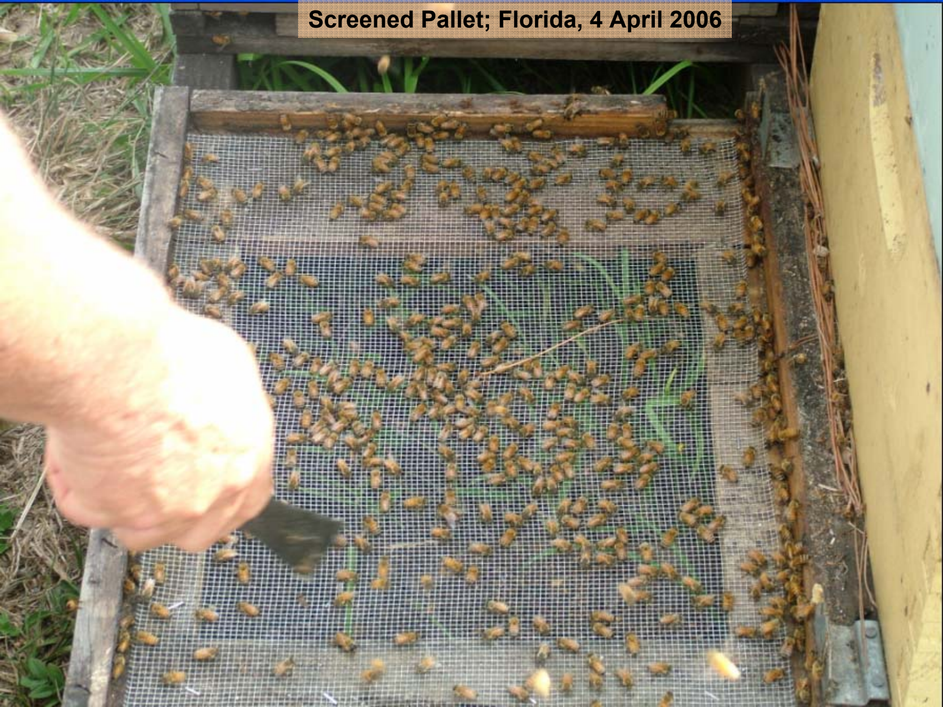
Screened Pallet; Florida, 4 April 2006