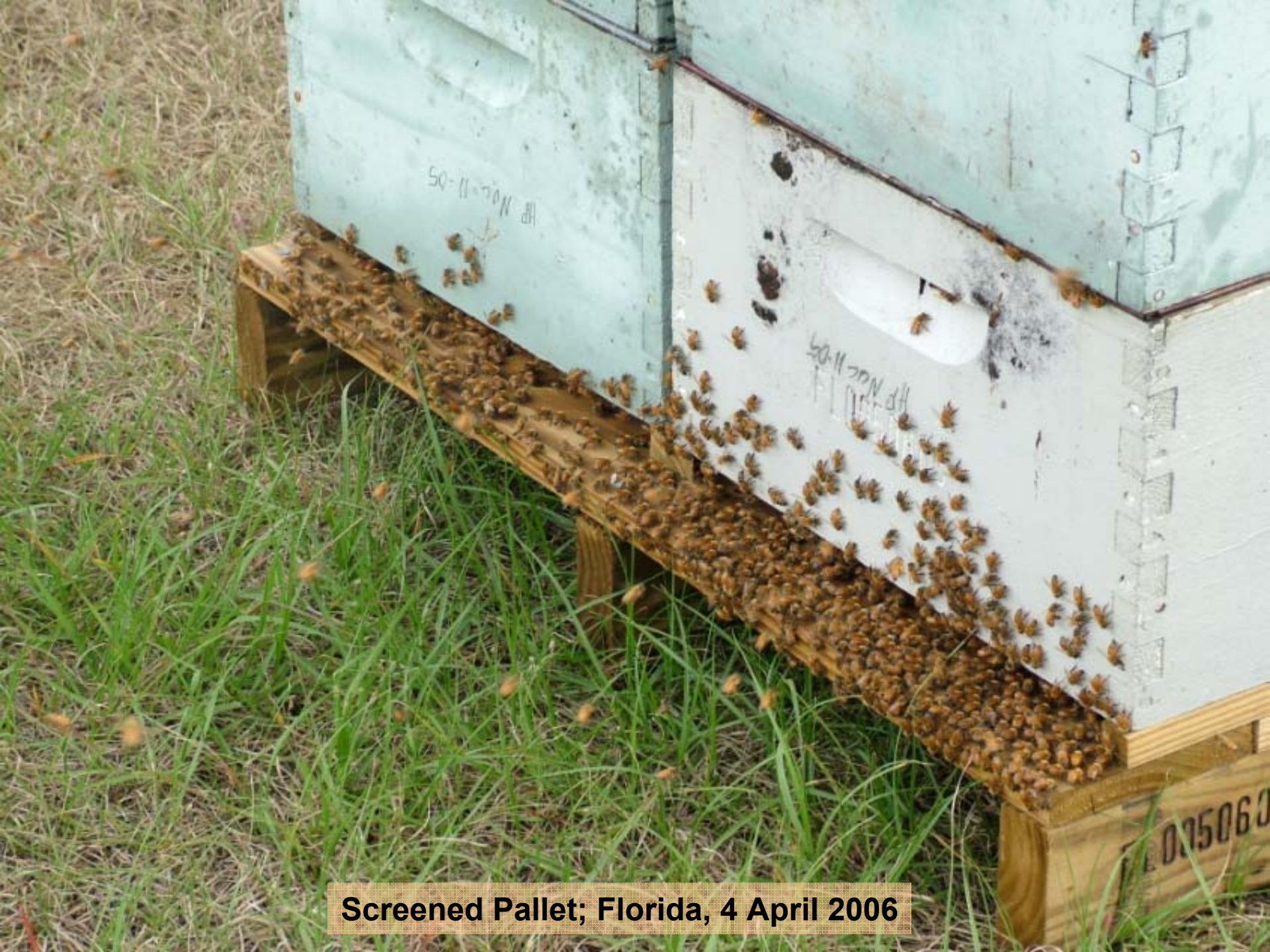
Screened Pallet; Florida, 4 April 2006