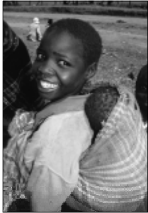
Baby carried in a Kanga.

Mothers use a Kanga (long, colorful cotton cloth), to carry children on their back. The Maasai, Samburu, and Turkana groups retain traditional dress.