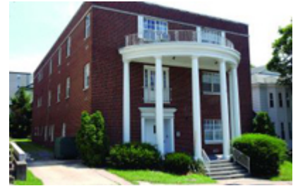
WVU International House